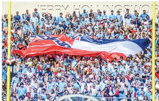
The Ole Miss Student body displayed the Mississippi State Flag at one of their most recent home games. Unfortunately the Politically Correct Campus Security took the flag from them removing it from the stands.